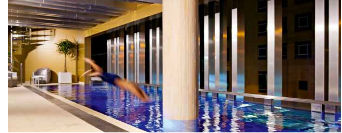
Above: Pooled resources ... luxury at the Olsen.

The sixth? Watch this space; Brunswick looks good,